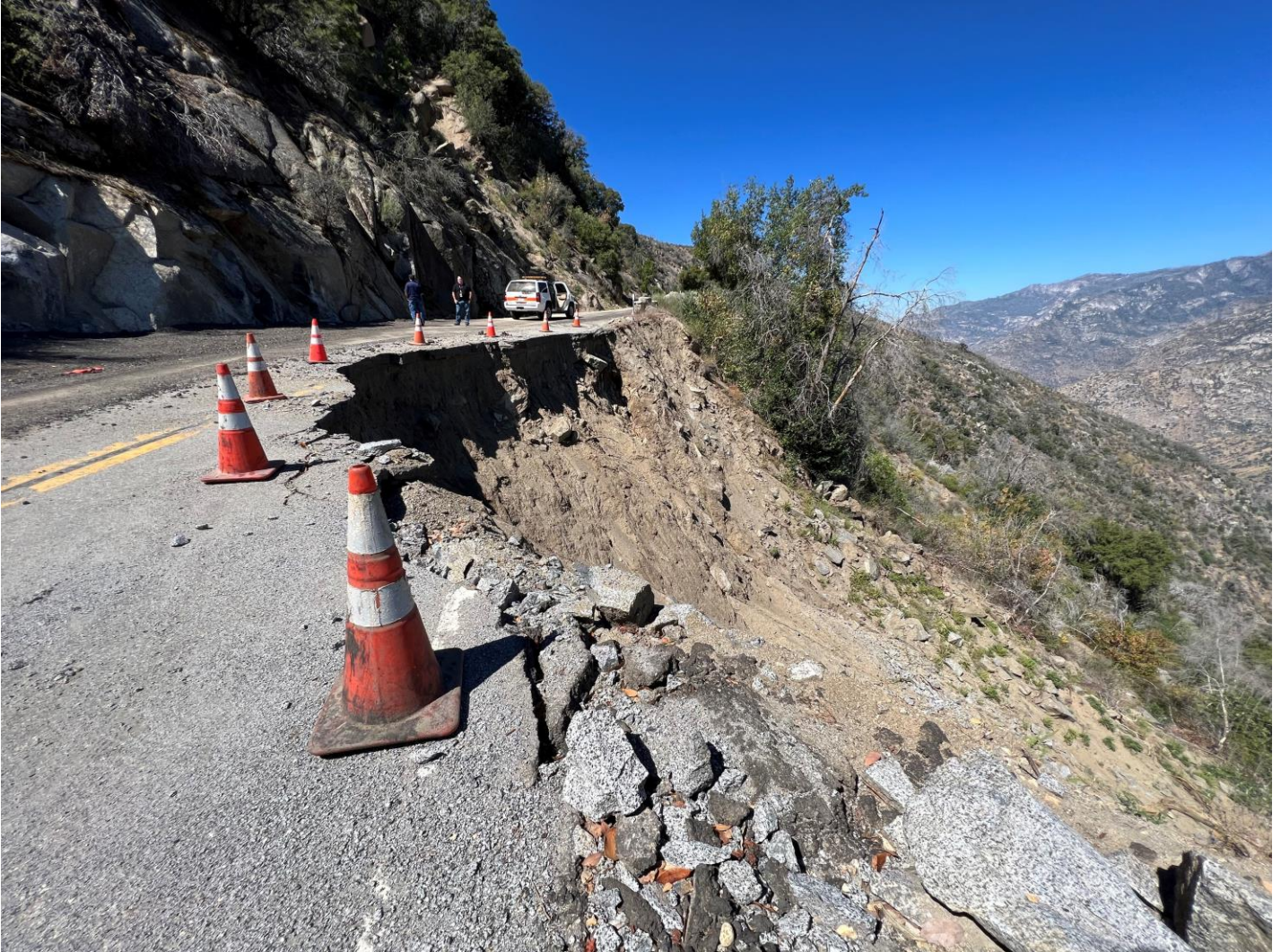
Site 2 PM 121.2 – Photo at Ground Level Taken on August 29, 2023