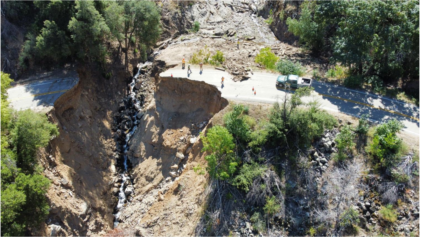
Site 3 PM 128.1 – Photo Taken via Drone on August 29, 2023

Caltrans wants to remind drivers to stay attentive and undistracted while driving and to be cognizant of workers and vehicles in construction and maintenance areas and slow down while driving through work zones.