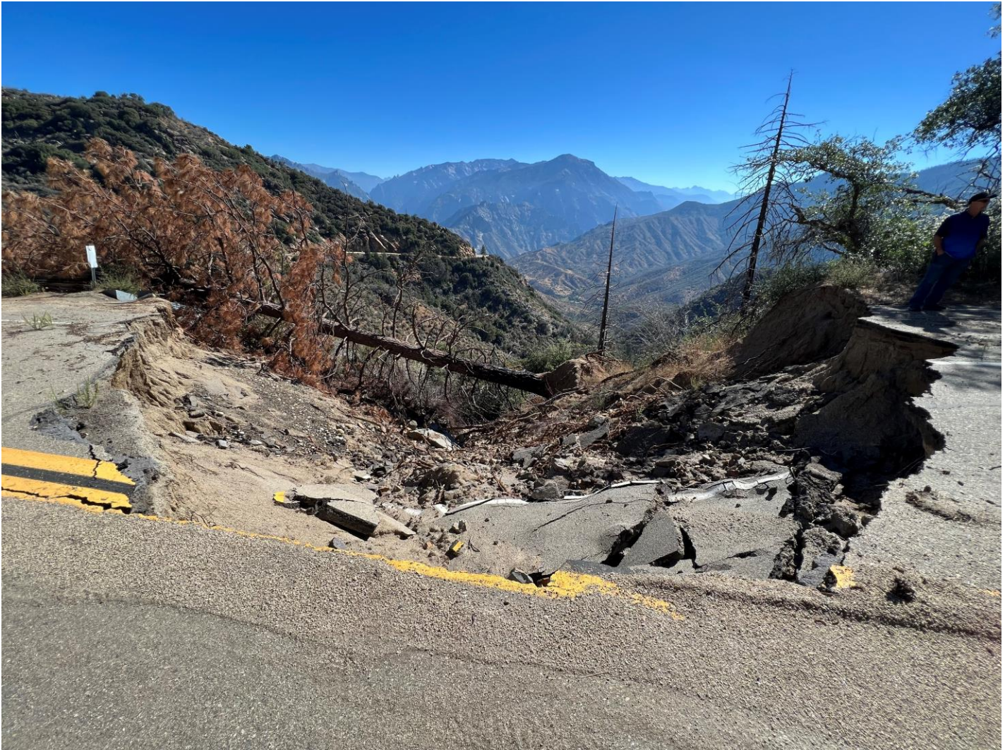
Site 1 PM 118.5 – Photo at Ground Level Taken on August 29, 2023