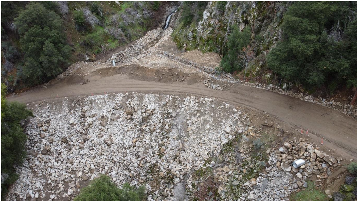
Figure 3: Flyover drone image of roadway of grading progress at PM 128.1

Visit CleanCA.com to learn more about how Clean California is transforming communities and how you can get involved.