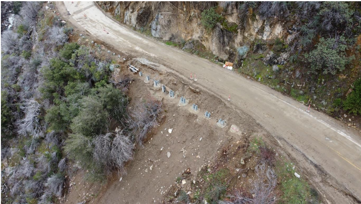
Figure 2: Flyover drone image of retaining wall at PM 126.3