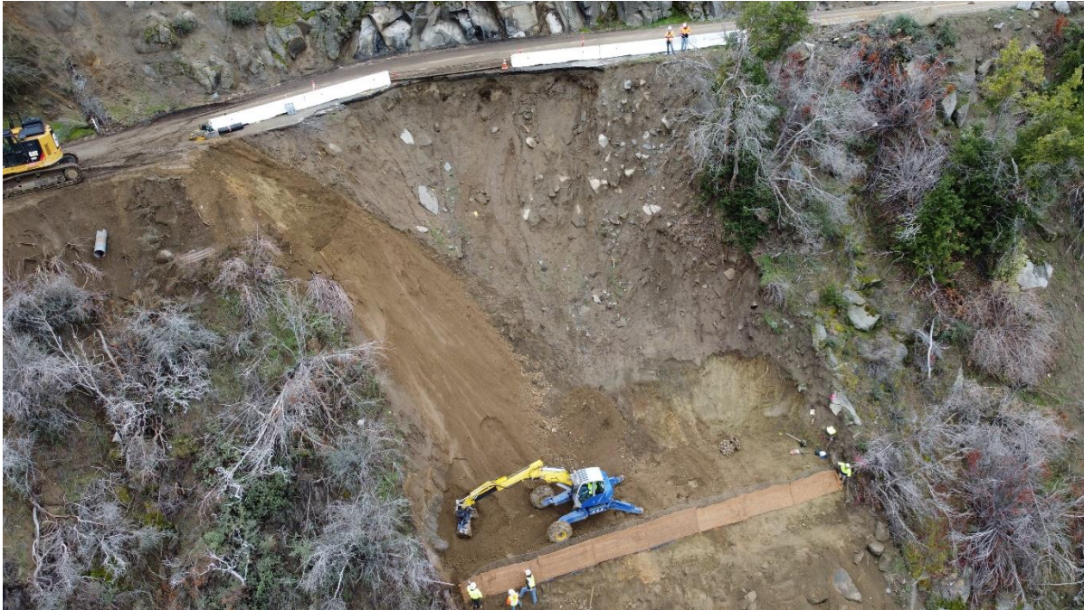
Figure 1: Flyover drone image of engineered fill at PM 121.2