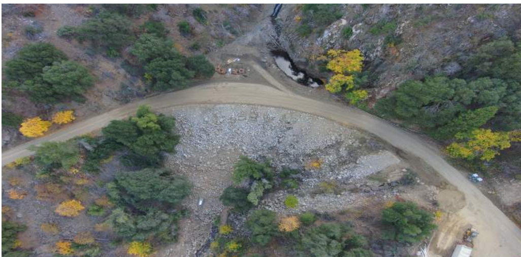
Figure 3: Flyover drone image of repairs made at Site 3.