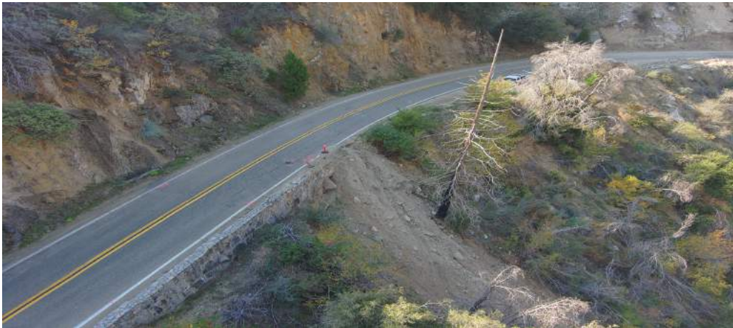
Figure 2: Flyover drone image of damaged retainer wall at Site 5.