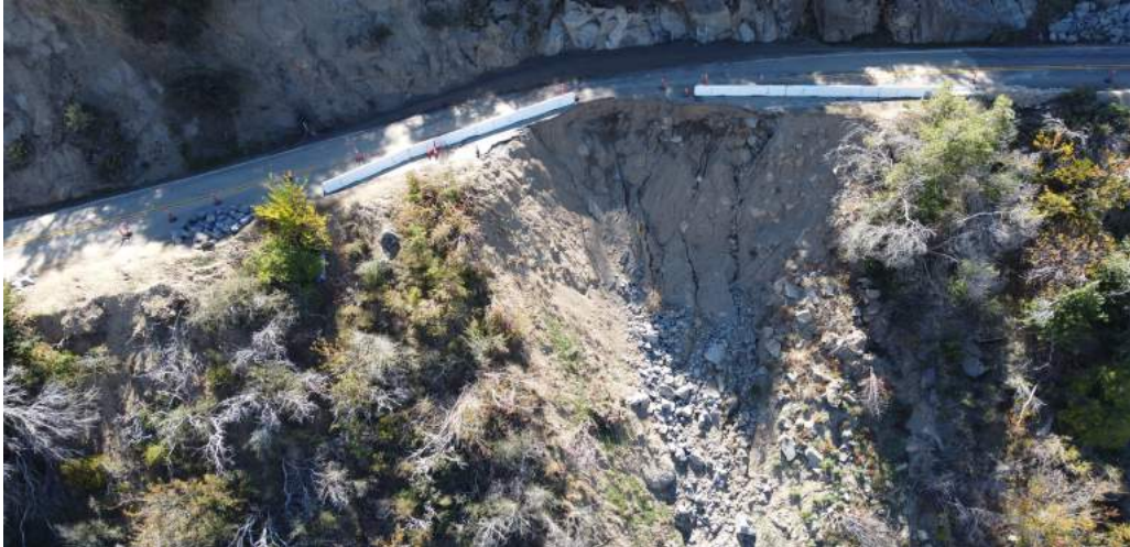
Figure 1: Flyover drone image of washout at Site 2.